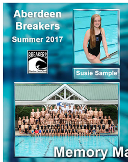
Memory Mate Includes Team and Individual images com- bined with Name and