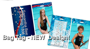
Bag Tag - NEW Design