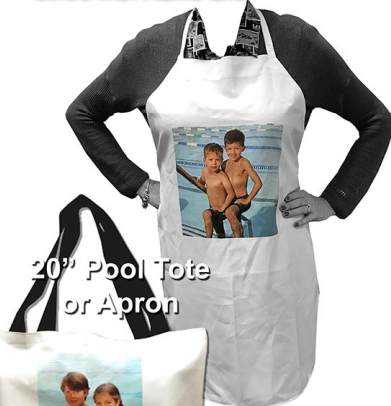
20" Pool Tote or Apron