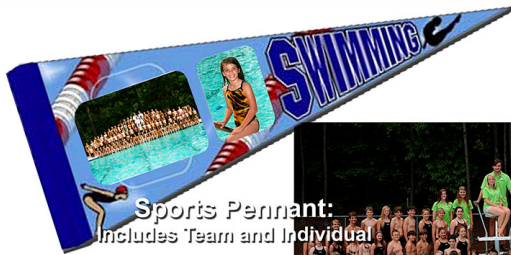
Sports Pennant: Includes Team and Individual