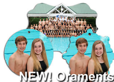
NEW! Ornaments Choose from 3 different designs