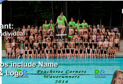
Team Photos include Name & Logo