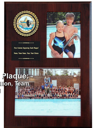
Medallion Memory Plaque: Solid Wood, Swim Medallion, Team and Individual