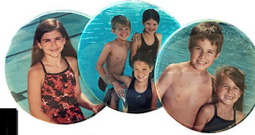
Free with every package: 3" Photo Buttons