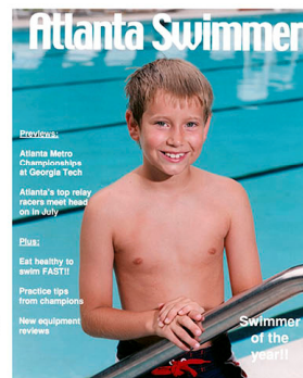
Swim Magazine Cover