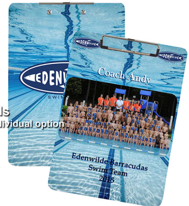
Clipboards Available in team and individual option