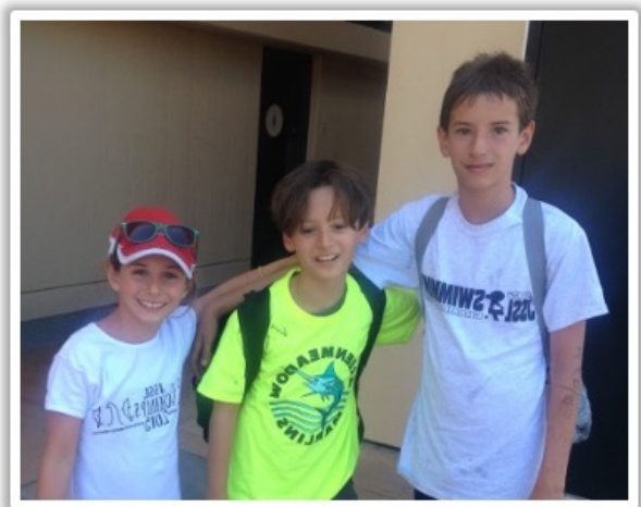
MARLINS CHAMPS AT AVERY POOL