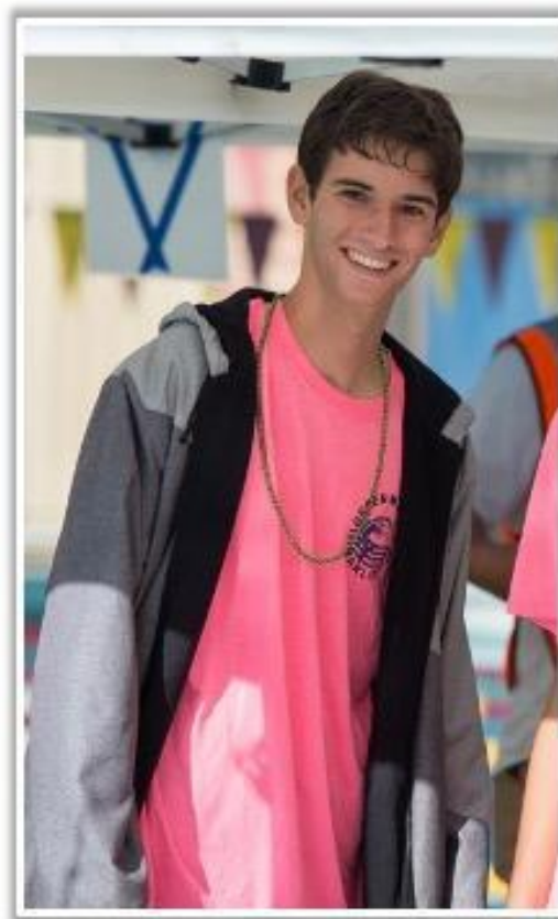
MARLINS CHAMPS AT DE ANZA COLLEGE