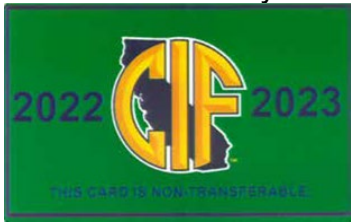
State CIF Courtesy Card