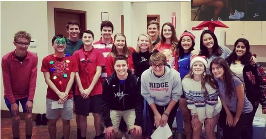
Christmas Pasta Party Highlights